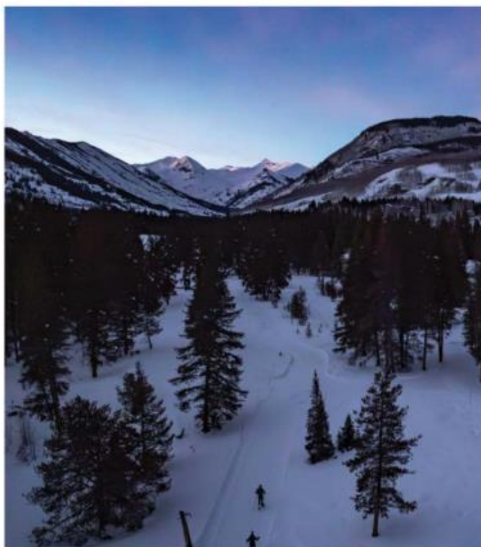
TOP: Courtesy of Jeremy Swanson