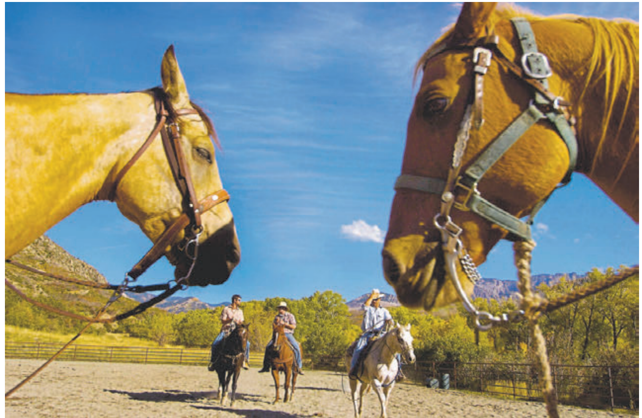
Local cowboys showed off riding and roping skills to the guest of the Smith Fork Ranch during a cowgirl weekend. Denver Post file,

1 Lake Ave., Colorado Springs, 866-334-3693, broadmoor.com/the-wilderness-experiences/the-ranch-at-emerald-valley/