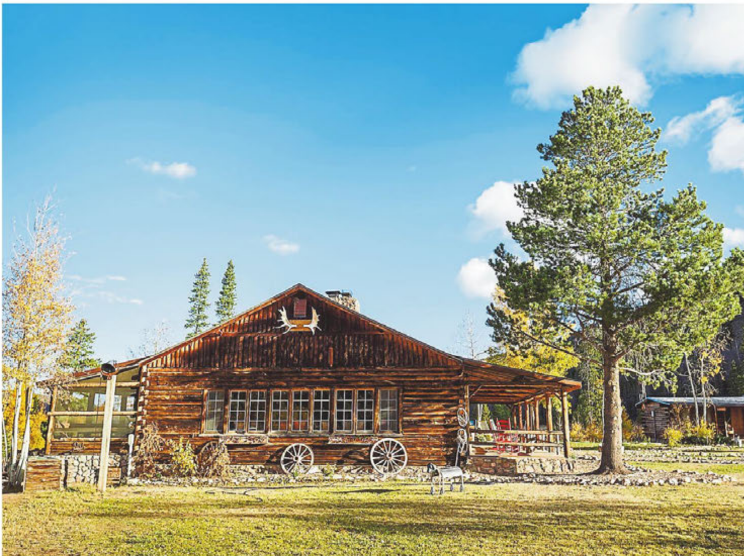
The Rawah Guest Ranch, located just south of the Colorado-Wyoming border, is a family escape sitting at 8,400 feet in the Laramie River Valley.