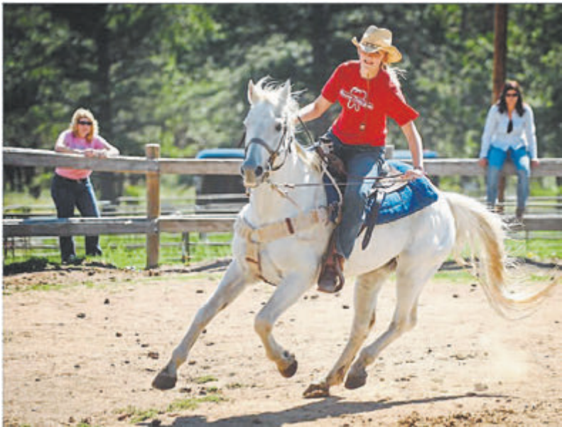
Arena Games at Sundance Trail Ranch, one of the smallest of the Colorado dude ranches.