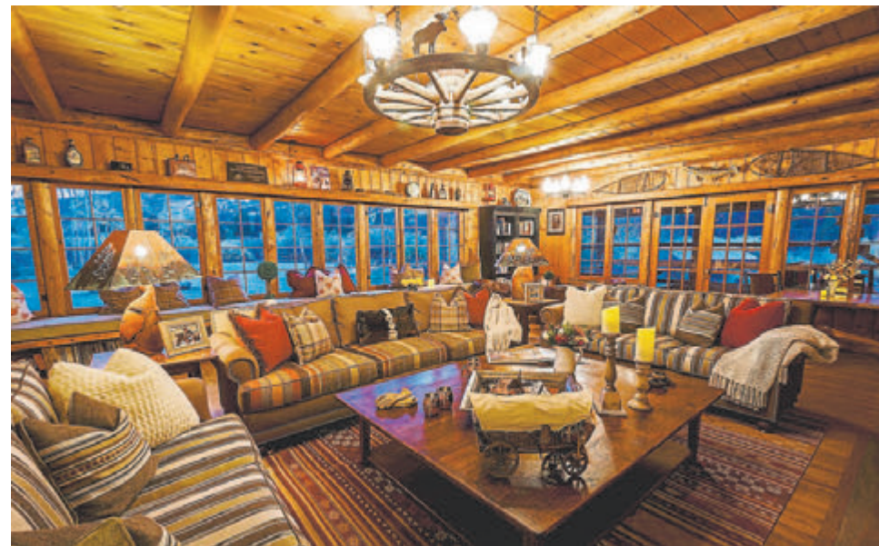
The common room at the Rawah Lodge, named for the rugged and majestic snow-capped mountains that rise above the ranch.

A herd of horses run down the entrance road during the morning jingle.