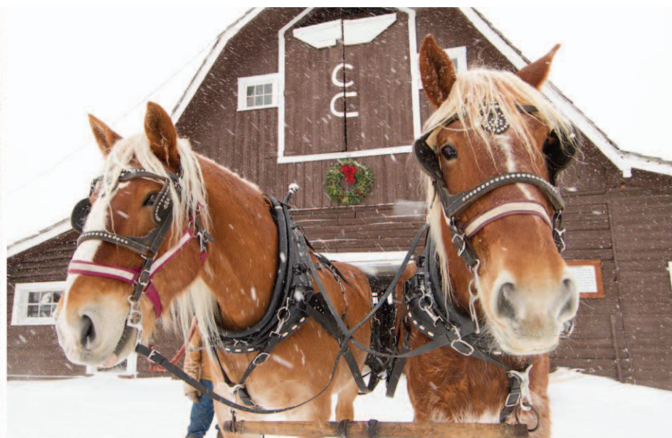
Wintertime at C Lazy U Ranch in Granby means horseback- and sleigh-riding along the groomed trails.