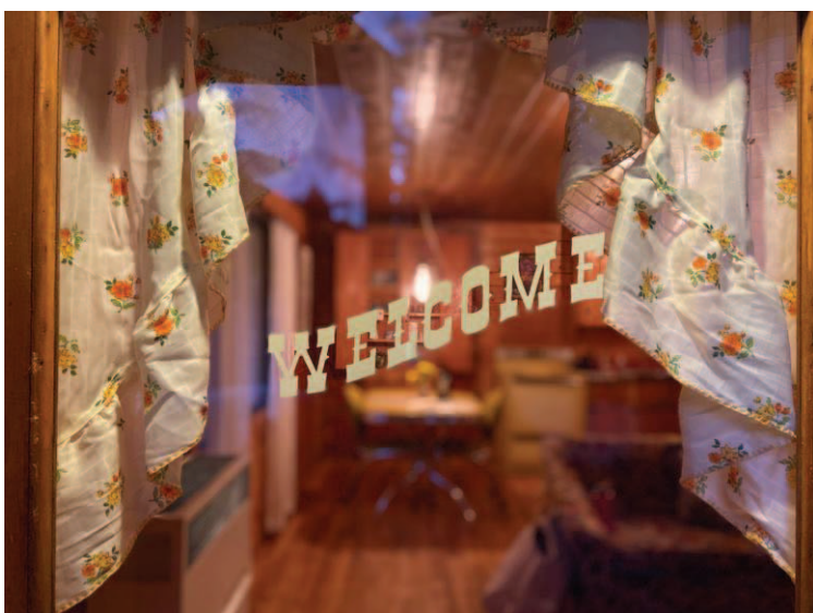
At The Flying Moon Cabins in Idaho Springs, guests have access to a wooded property along Chicago Creek. The four cabins feature midcentury furnishings and vinyl record players.