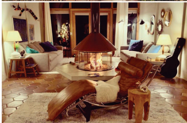
A view of the Wonder Haus when it's not blanketed in snow (top), and the Airbnb's fireplace-heated living room (below).

Best winter amenity: Gas fireplaces heat the cabins, and a communal sauna and hot tub are located at the center of the property for guests. While there are no grocery stores or restaurants within 30 minutes, the main lodge stocks a small pantry of drinks and dry goods that can be prepared in basic kitchens on-site.