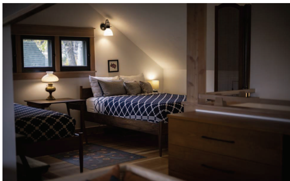
Two beds in an upstairs sleeping loft area in the Mary H. Galey Cottage on Oct. 23 at the Colorado Chautauqua in Boulder.