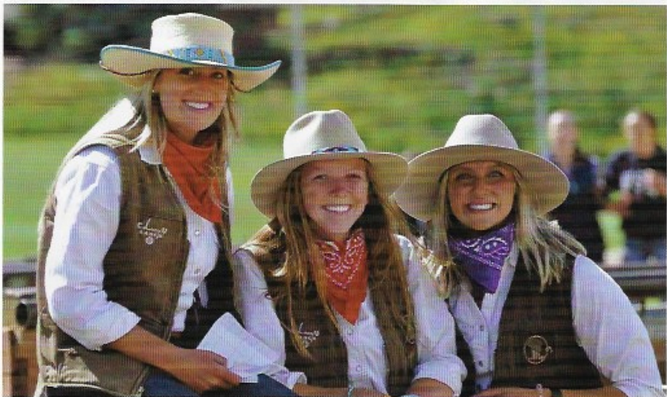
The ranch's wranglers are mostly young women who share a love of horses and teaching

"There were times I had to cowgirl up and prove myself, especially when some city slicker wanna-be cowboy would question my riding skills. I would take them out for a little ride and that would settle things down," she said.