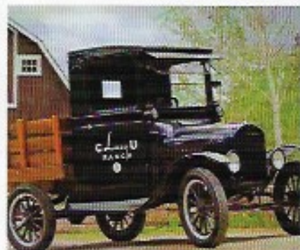
A vintage Model T in front of the barn, which was built in 1922

together. In the early 2000s the ranch received two coveted honors: the AAA Five-Diamond and Mobil Five Star awards. "The evaluating criteria changed and guest ranches were placed in the hotel category. They wanted us to add phones, TVs and air conditioning to guest rooms," Craig said, noting that didn't fit with their philosophy (rooms are equipped with WiFi and there are TVs in public spaces at the ranch).