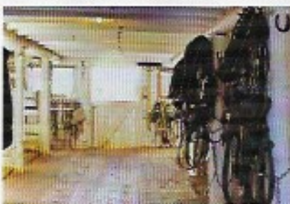
Tack room in the 1922 barn