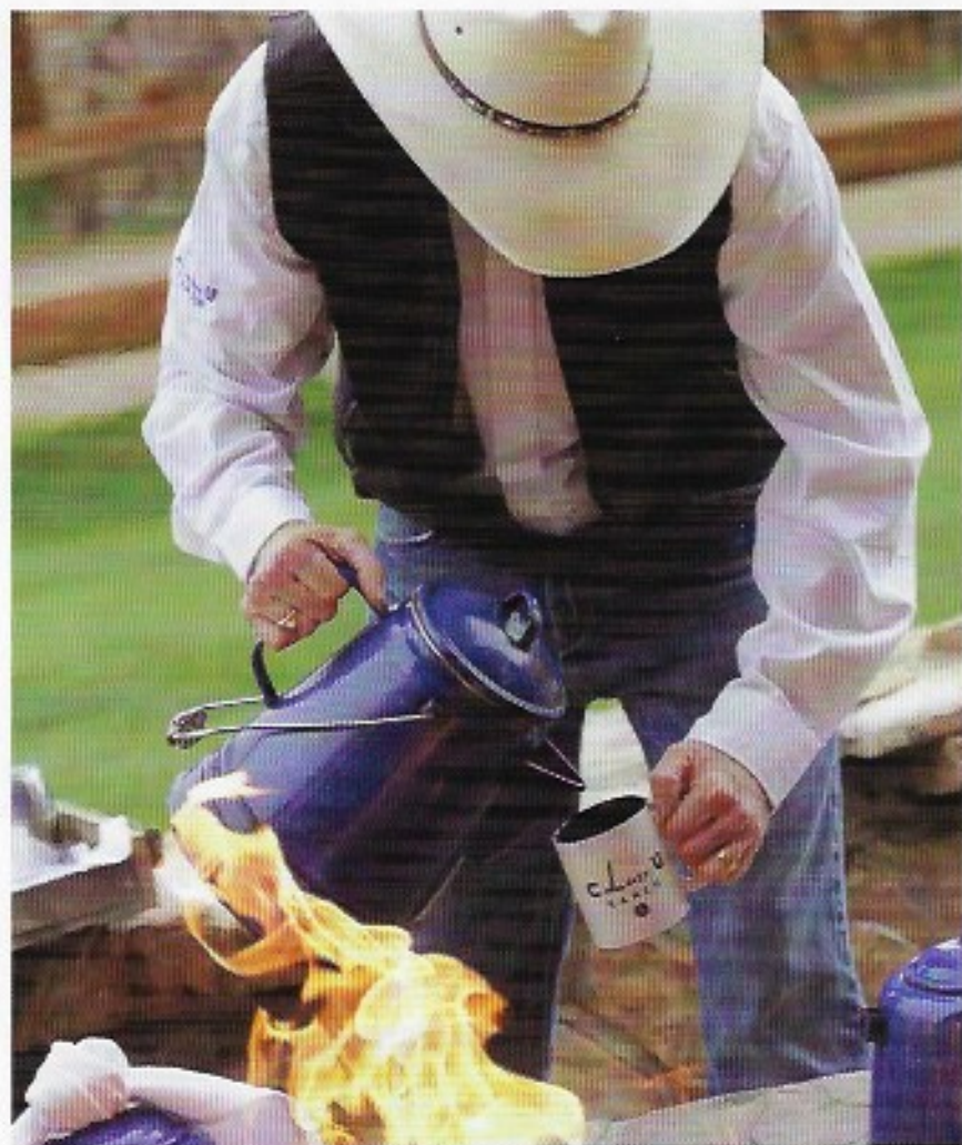
Cowboy coffee is served each morning to guests

Riding is the main activity at the ranch. After reviewing a guest's riding abilities, each is assigned a horse and saddle for a week and given ongoing riding instructions. Guests may choose to ride on more than 125 miles of scenic adjacent trails or practice their equestrian skills with an expert.