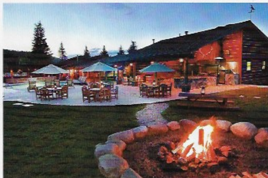
A firepit outside the Patio House, which has an outdoor pool and seating for meals