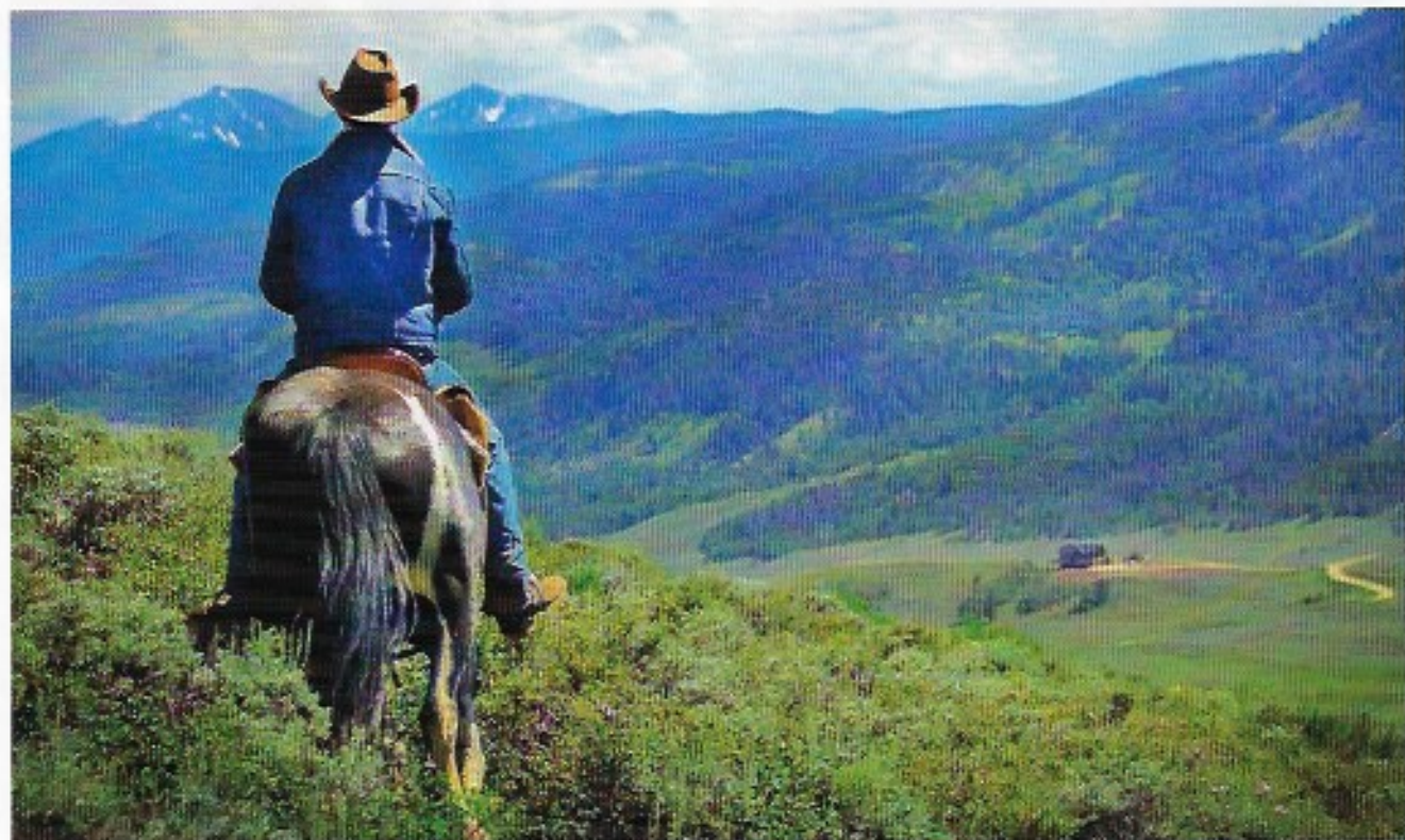
The C Lazy U Ranch in Grand County is celebrating its centennial