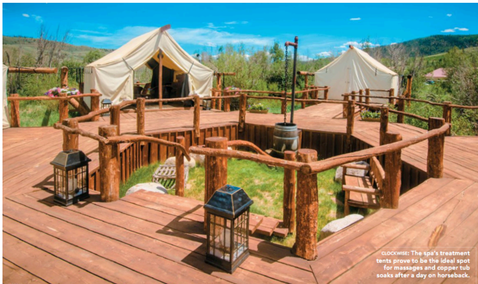
CLOCKWISE: The spa's treatment tents prove to be the ideal spot for massages and copper tub soaks after a day on horseback.