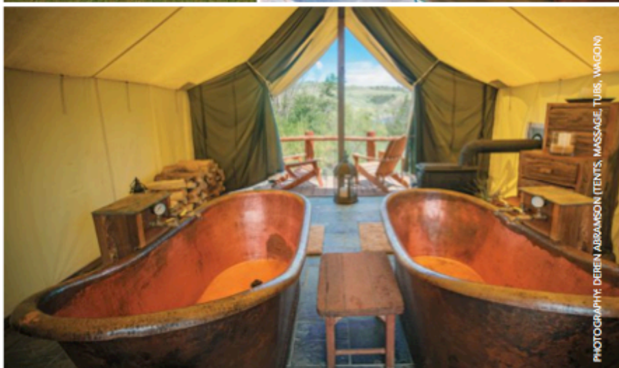
PHOTOGRAPHY: DEREN AUBAMSON (TENTS, MASSAGE, TUBS, WAGON)